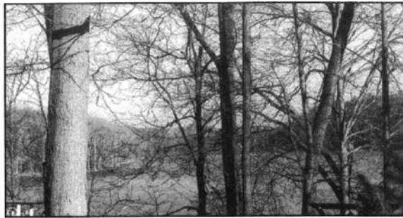
Indian Lake dates to 1923 when plans were initiated to dam Indian Creek and to develop housing along its hilly shores. It is thought the lake was filled about 1929.